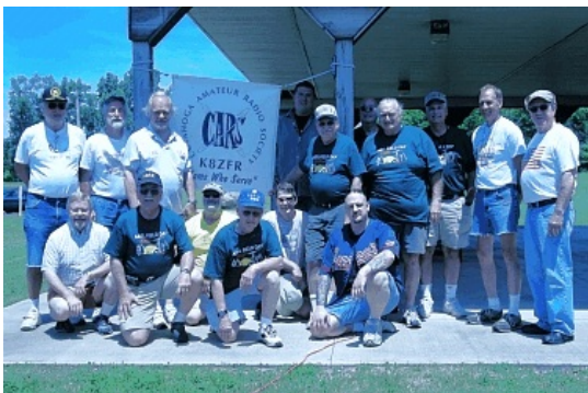
Group Pic of the Motley Crew