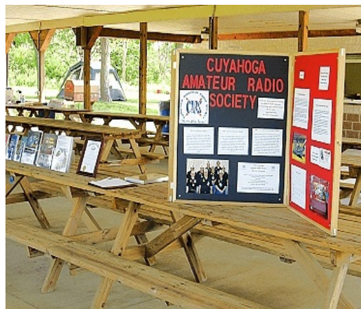
Visitor Center Display