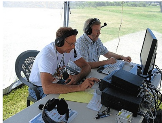
WT8O, K8SAS 20/80 meter SSB