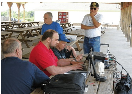
KC8BAL, KD8FTS, K8VJG, WB8CDA, & KA8MZS at the 10 meters phone station.